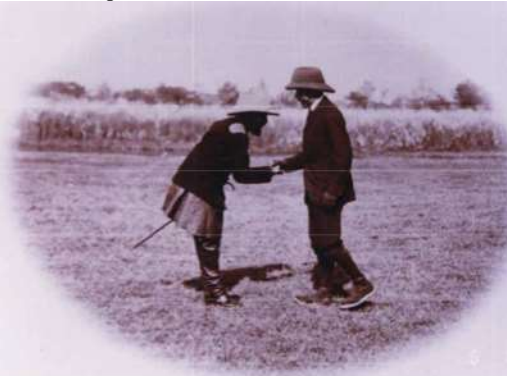
Prime minister Chandra Shumsher JBR greeting British Emperor George V in Chitwan in 1911 AD