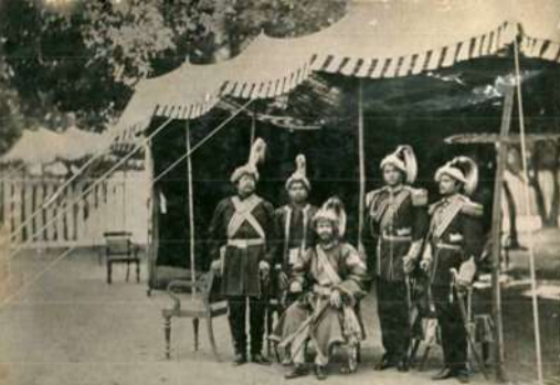
Viceroy Lord Mayo of Sohanpur Harihar India invited prime minister Jung Bahadur Kunwar Rana in 1871 November