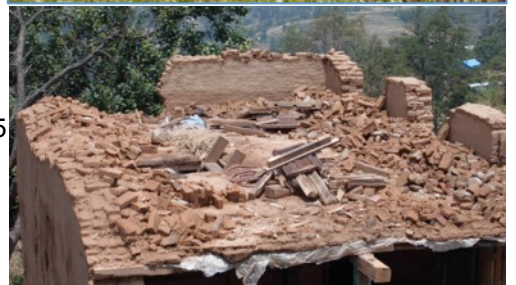
Houses damaged by the earthquake in Nagarkot village of Bhaktapur district