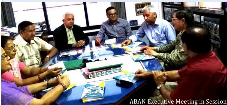
ABAN Executive Meeting in Session