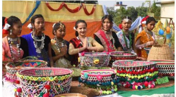
An Expedition to Tharu Community's Cultural Anonymity

British Council Nepal initiates Social Action Projects in schools to encourage students to work closely with their community members and local organisation to create awareness about social responsibility and show effective action. This student-led initiative focuses on tackling issues relevant to local communities while helping students develop leadership and team-building skills. This year, Gurukul Academy from Dhangadhi, Kailalai, Nepal with training and funding support from the British Council, planned the 'An Expedition to Tharu Community's Cultural Anonymity' as part of their Social Action Project.