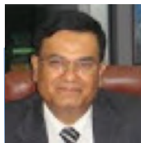
Uttam Prasad Pant

Yogamaya was a renowned social reformist during the Rana regime and she struggled during 1916 to 1941 against the social injustice, economic suppression and propagated social change in the most rigid dictatorial rules of Rana regime during 1847 to 1951. Yogamaya Dham is presently a center for social reformists.