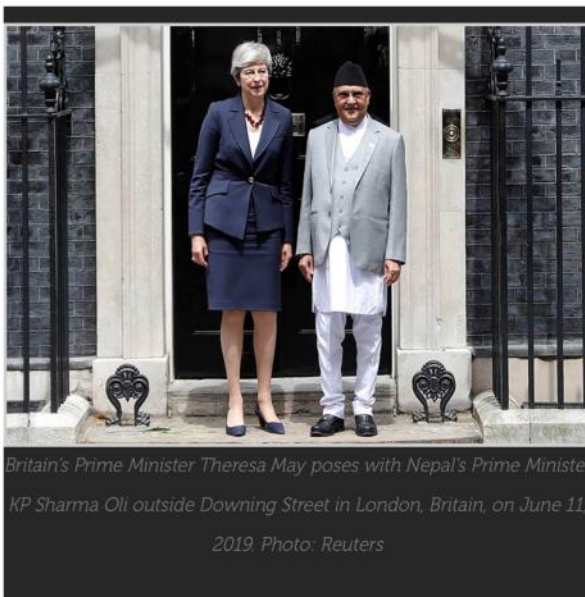
Britain's Prime Minister Theresa May poses with Nepal's Prime Minister KP Sharma Oli outside Downing Street in London, Britain, on June 11, 2019.

Oli made the statement at a press conference organised at Tribhuvan International Airport upon arrival from his three-country Europe visit today. Oli visited Switzerland, the United Kingdom and France from June 8 to 15.