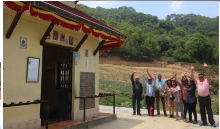
ABAN Picnikers enjoying the temple visit by the jungle

ABAN Life Members and their family and friends joined the picnic on May 5, 2018 at Tiger Lily resort Sirutar, Bhaktapur. The picnickers enjoyed the clean green environment of Tiger Lily Petting Farm & Hands on Museum, jungle hike to Bindabashini and Shiva temples in Buruwa and Anantalingeswor.