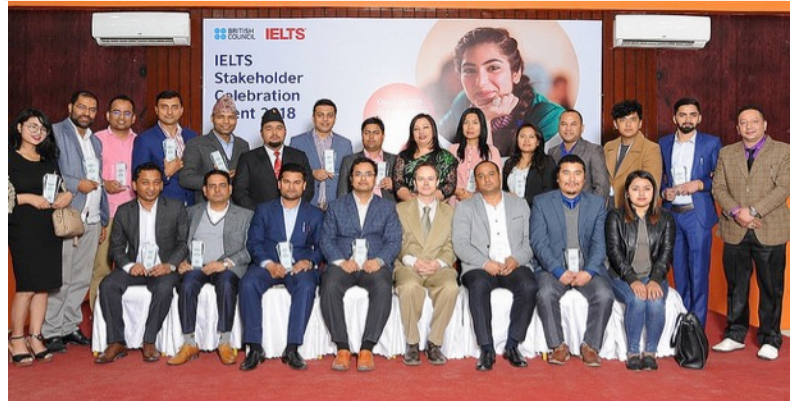
Representatives from different educational consultancies after receiving award from British Council Nepal