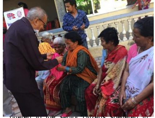
Tapasthali Bridhashram at Chapali on March 2, 2017. This will be a regular annual activity of ABAN jointly with MSMT during the week of ABAN Day on February 4.

ABAN also works for cultural and educational exchange between Nepal and Britain.