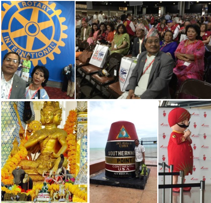
Rotary conference in Atlanta, Brahma ji temple in Las Vegas, Southernmost point of USA in Key West, Air India mascot: starting nonstop flight from Washington to Delhi from July 7

He made post-convention visits to Florida, Washington DC, Virginia, San Francisco, Las Vegas and Grand Canyon before taking Air India's Inaugural non-stop flight from Washington Dulles airport to Delhi India on July 7, 2017. Here are some snap shots of the visit.