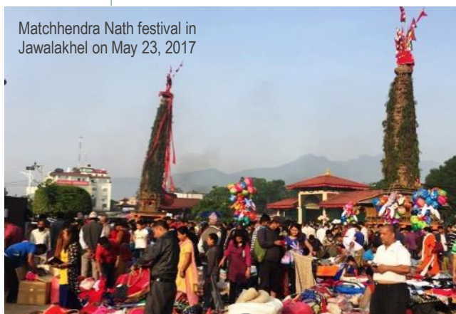
Matchhendra Nath festival in Jawalakhel on May 23, 2017