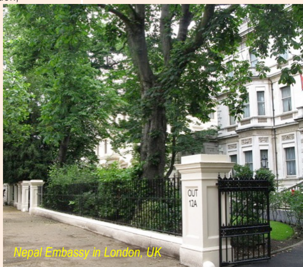
Nepal Embassy in London, UK

ABAN and its members wish His Excellency a very successful tenure.