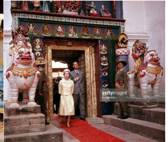
Her Majesty Queen Elizabeth II and the Duke of Edinburgh at the Hanuman Dhoka gate of Kathmandu, considered as the center of Nepal.