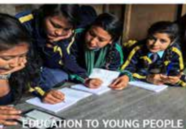
EDUCATION TO YOUNG PEOPLE