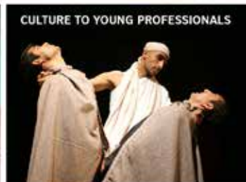
CULTURE TO YOUNG PROFESSIONALS

CREATING AN OPEN AND INCLUSIVE SOCIETY, WITH STRENGTHENED FRIENDLY KNOWLEDGE AND UNDERSTANDING BETWEEN THE PEOPLE OF NEPAL AND UK