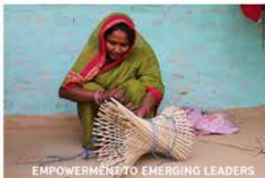
EMPOWERMENT TO EMERGING LEADERS