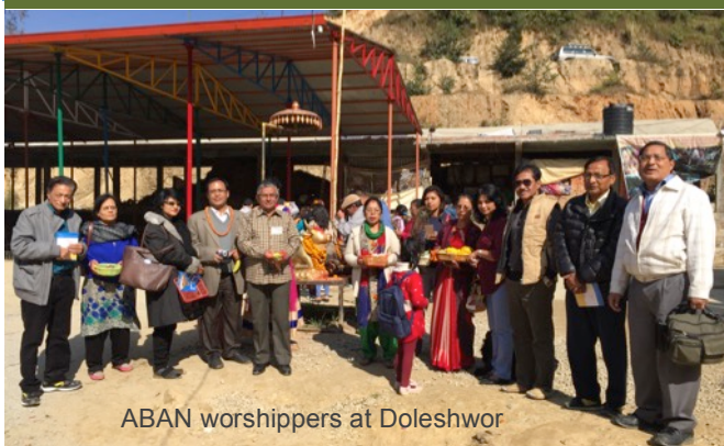
ABAN worshippers at Doleshwor