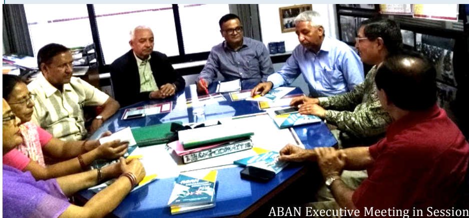
ABAN Executive Meeting in Session